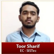
Toor Sharif EC - SISTec